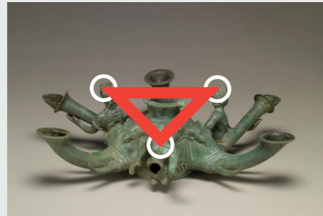
Equality in Colchic Bronze